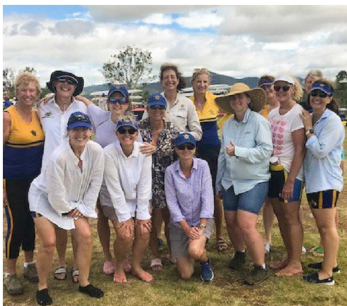
MW Squad Scenic Rim Regatta 2021