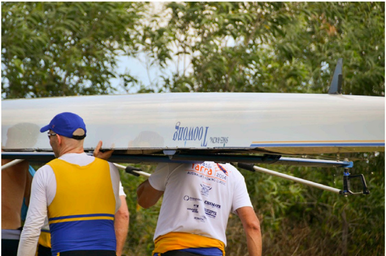
TRC Job done