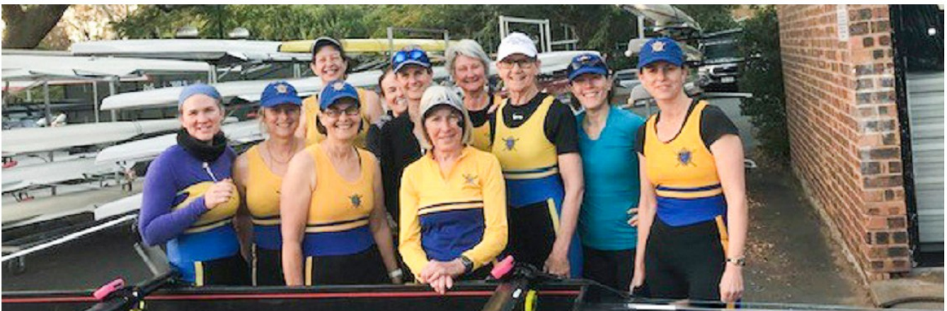
Winter Series 2020