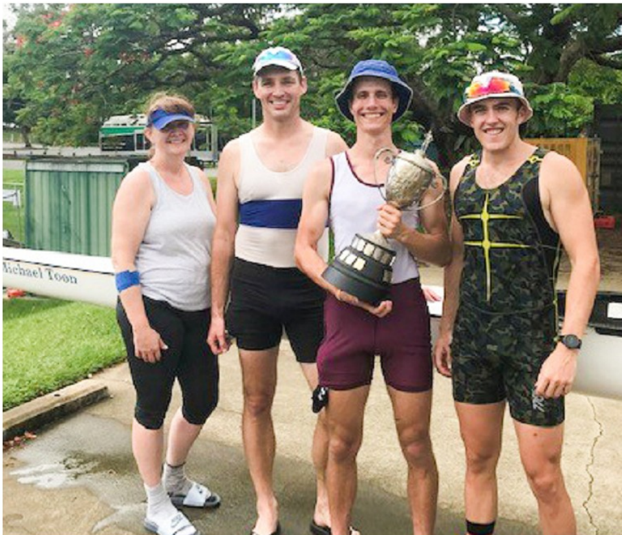
Kibble Cup 2020 Winners.