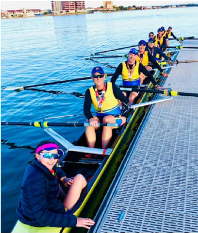
AMRC 2021 MMC8+ Champions