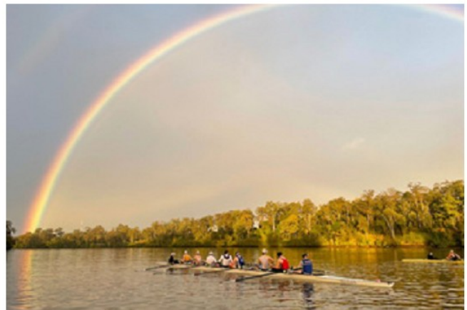
HP Training Magic Rainbow