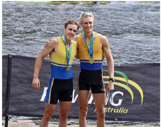
U23 LM2- Win