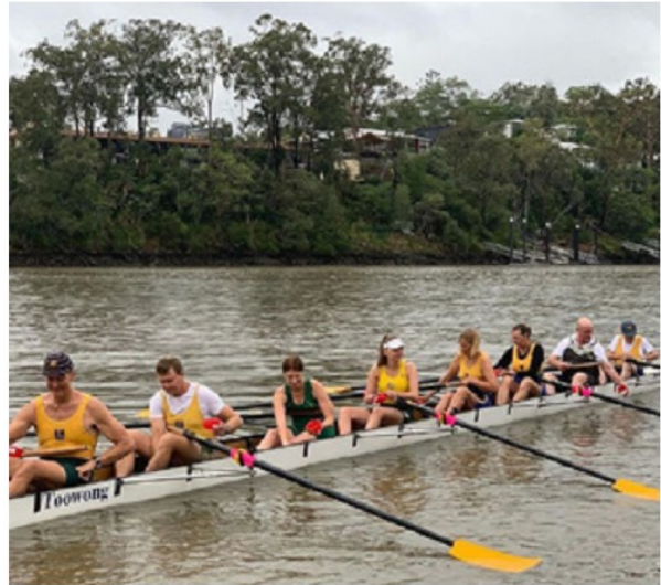
Tom Jack Memorial Crew