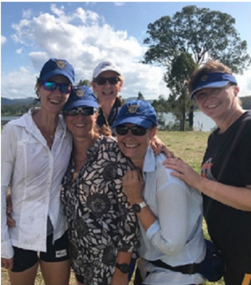
Ladies at Wy Regatta