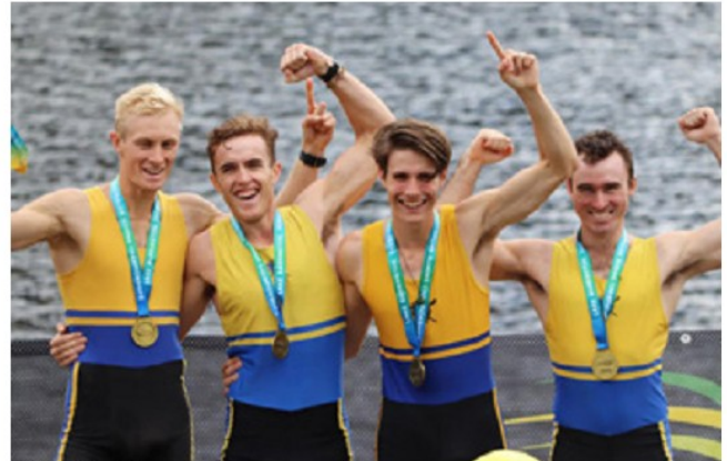
U23 LM4- Win