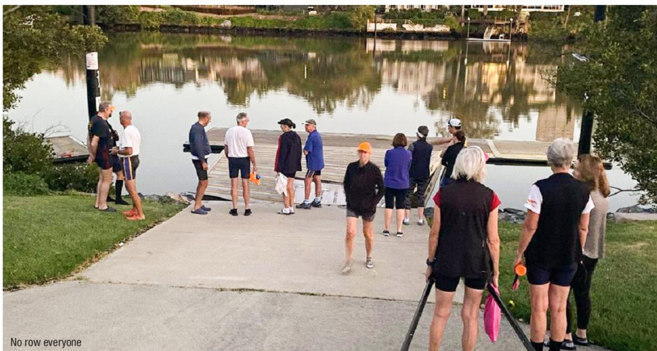
No row everyone