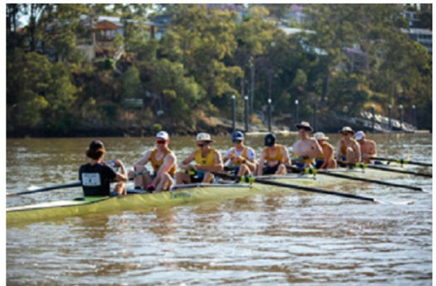
Open Mens 8+ HOTB