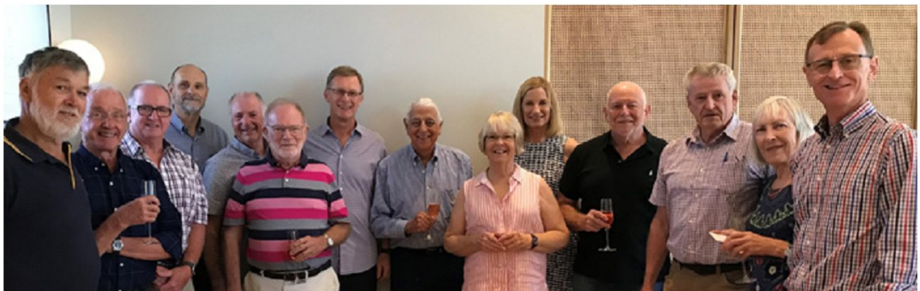
TRF Formation Management

The foundation board's immediate objectives are to leverage its skills, connections and available funds to undertake much larger fundraising for the long-term benefit and financial security of the Toowong Rowing Club. It is also seeking to recruit additional directors with appropriate skills and experience.