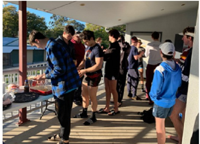
TRC Club Breakfast June 2021 - New Recruits