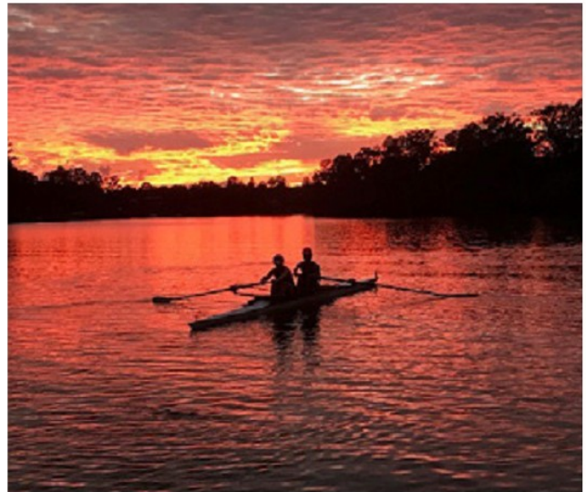
Sunrise Squad MW 2021