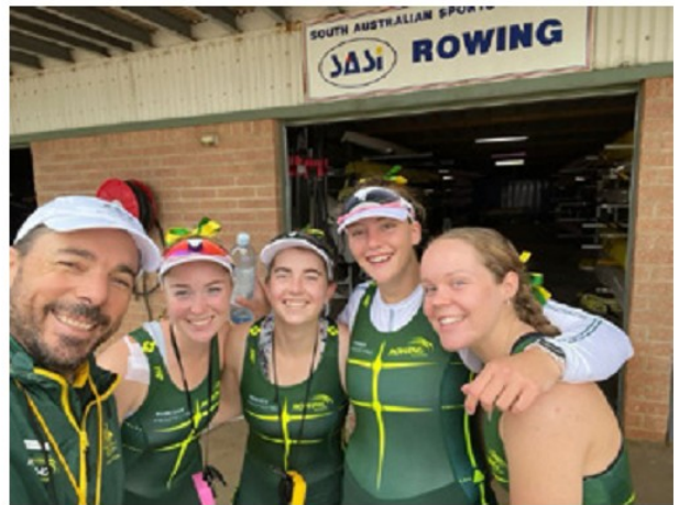
AUS U21 Womens LWT4x Good Time