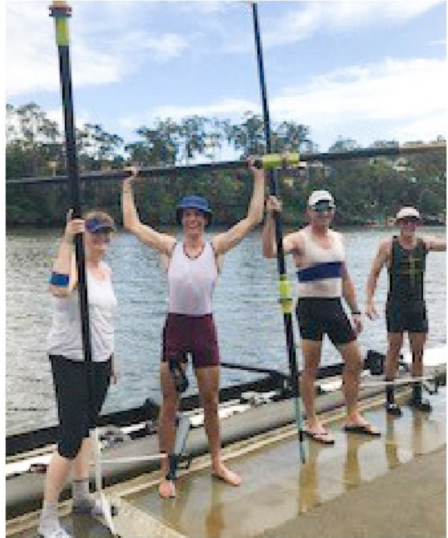
Kibble Cup 2020 Winners.