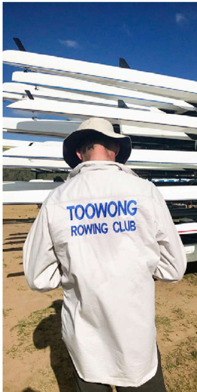
Got Your Back TRC