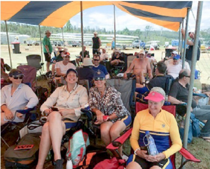
Scenic Rim Regatta Tent Time