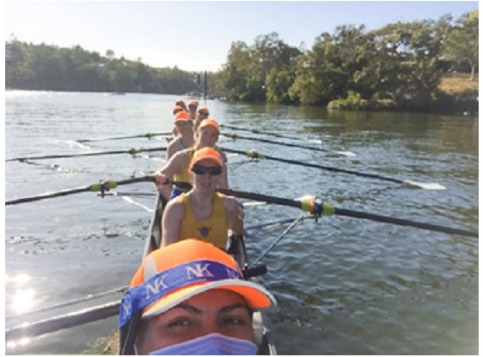
Brown Snake 2020 WMD8+ Winners!