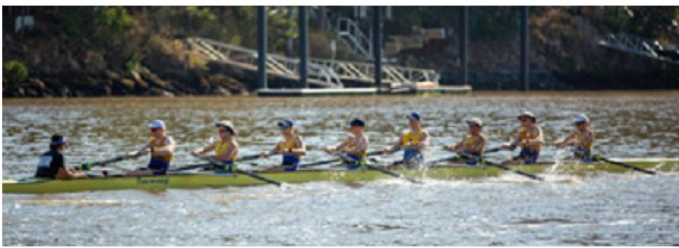
Open Womens 8+ HOTB