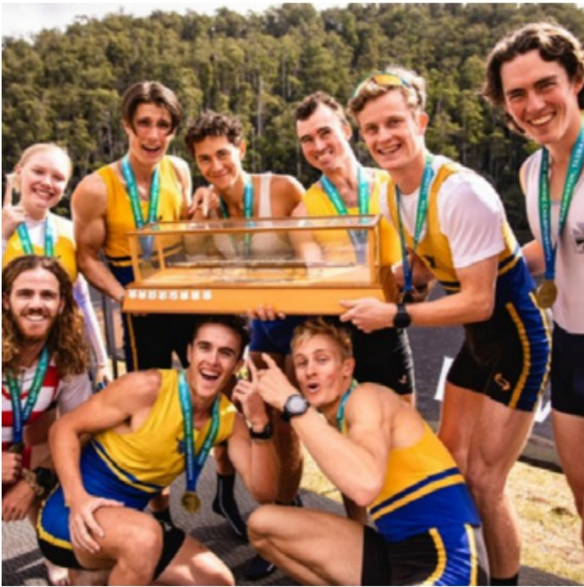
2021 LWT Men's 8+ Champions - Lake Barrington