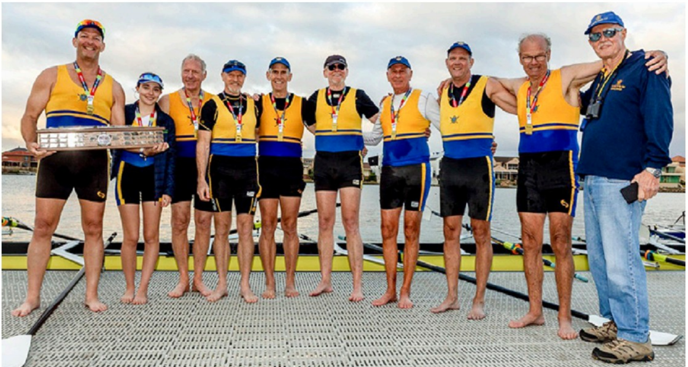
AMRC 2021 Mens Club 8+ Champions