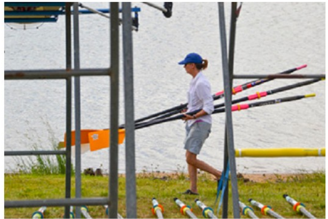
Coach helping out