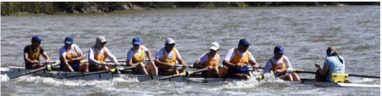
Maryborough Bridge To Bridge August 2020