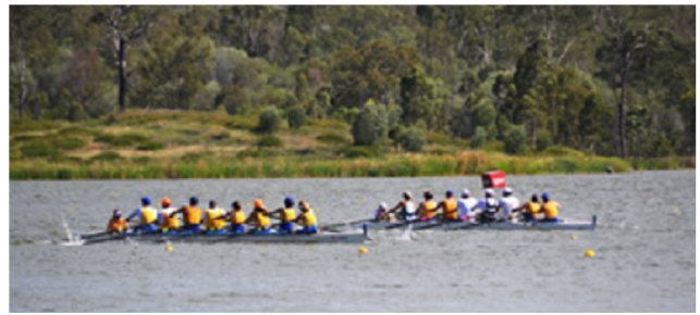
Mixed E8+ Racing Wyaralong