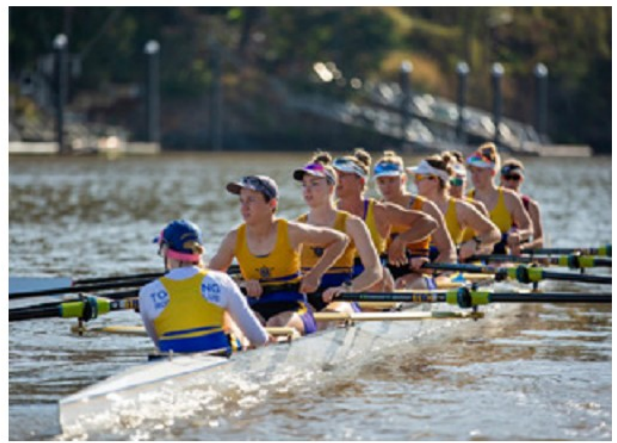
HOTB Women's HP