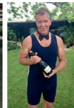
Lady Killer in zooty