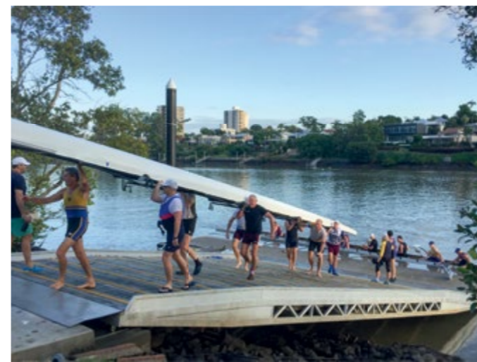
Sat Mens 8+