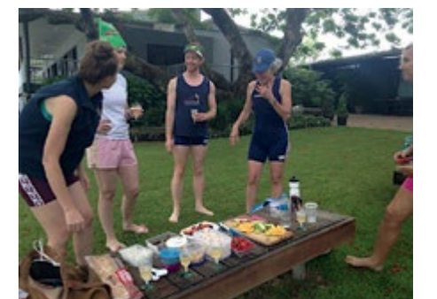
Post row picnic