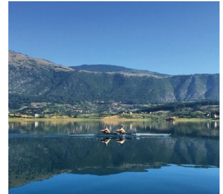
TRC National Representatives 2015

I encourage this to continue. Keep finding ways to break down the barriers between our groups; even for a quick chat or a helping hand; a little bit of mutual understanding; a few shared experiences. I think if we all made a little effort in this regard, we could turn something that has been remarkable and special into something that is truly incredible.