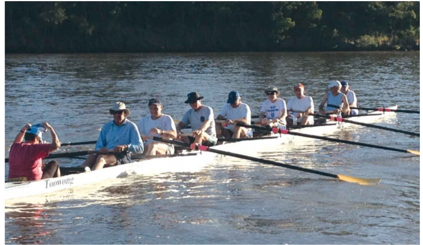
Our Senior Statesmen