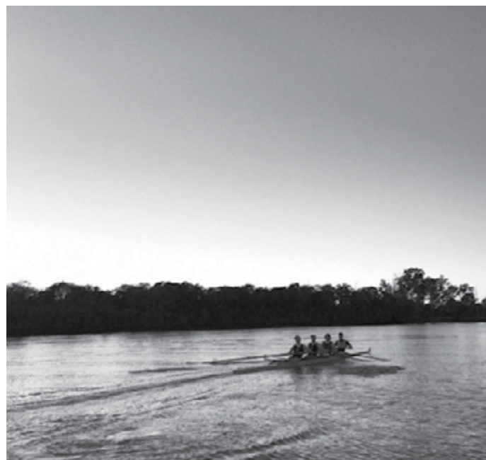
Australian Jnr M4-